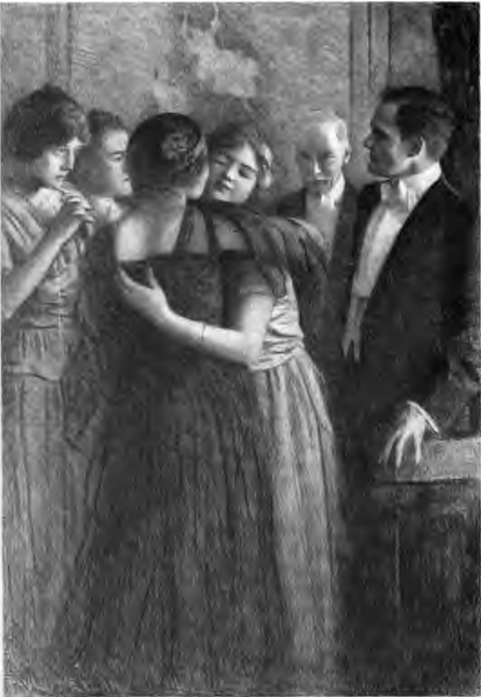
Adelaide wasn't going to have any scene like that